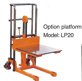
Option platform Model: LP20